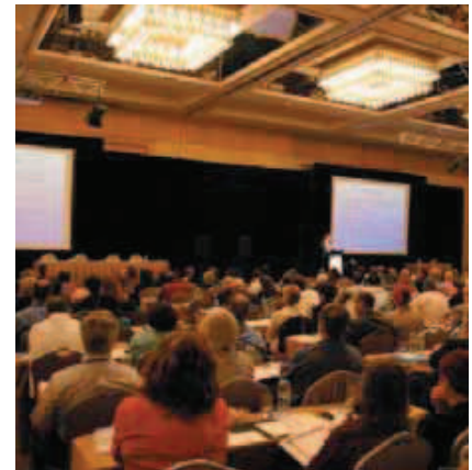
The conference in session